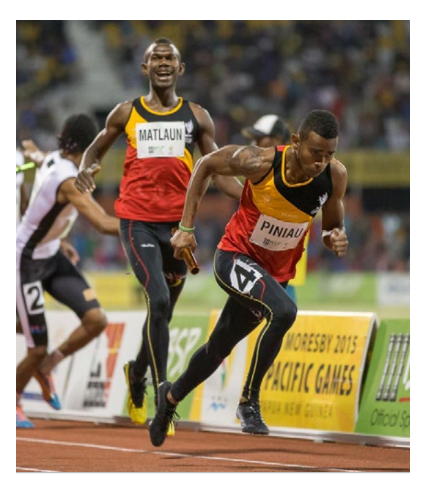
ROAD TO SAMOA: Athletes will miss out on the Games if their NFs do not meet the requirements of the Justification Committee.

A final process of endorsement for all Team PNG athletes selected for the Pacific Games in Samoa this year will be carried out from March 18 to 26 by the Papua New Guinea Olympic Committee Justification Committee (JC).