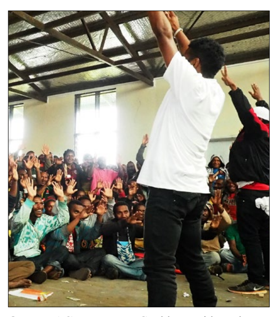
OUTREACH: Team PNG athletes with students in the Southern Highlands province during an OVEP session in 2018.

One of the programmes they highlighted was the HERO programme where Team PNG athletes are trained and given the tools to deliver different programmes.